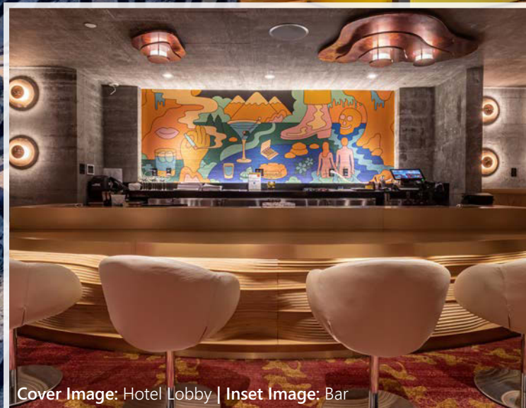
Cover Image: Hotel Lobby | Inset Image: Bar