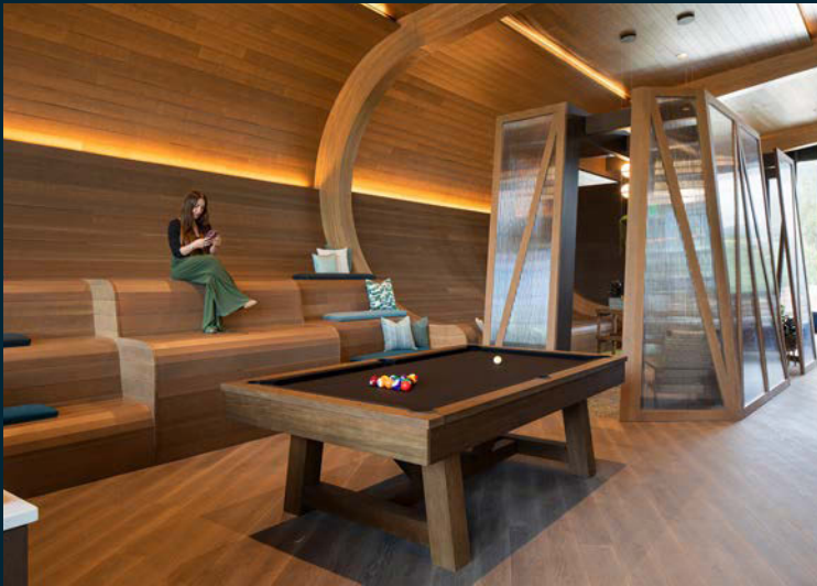
Lone Rock Retreat