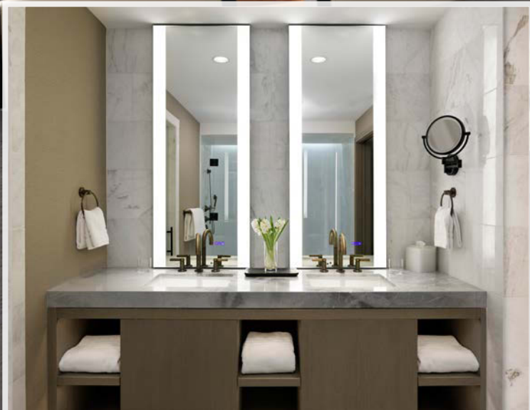
Cover Image: Dining and Kitchen | Inset Image: Bathroom