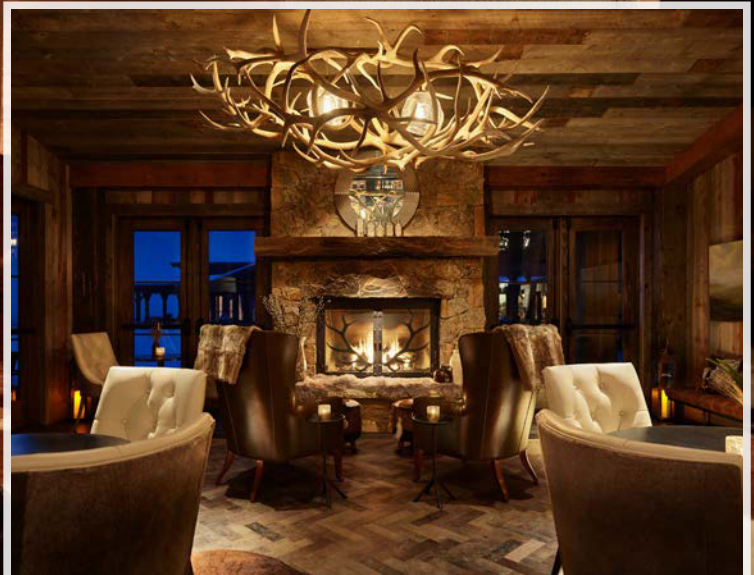
Cover Image: Spirit Bar | Inset Image: Lounge

The project: A 30,000 acre ranch offering 5-star amenities including dining, retail, brewery, distillery, wine tasting, meeting spaces, and an event pavilion.