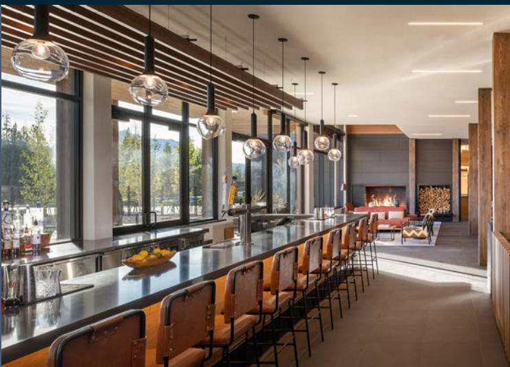
Ulery's Lake Lodge

Hotel Alpenrock Curio by Hilton , Breckenridge, CO | Full Service Hotel