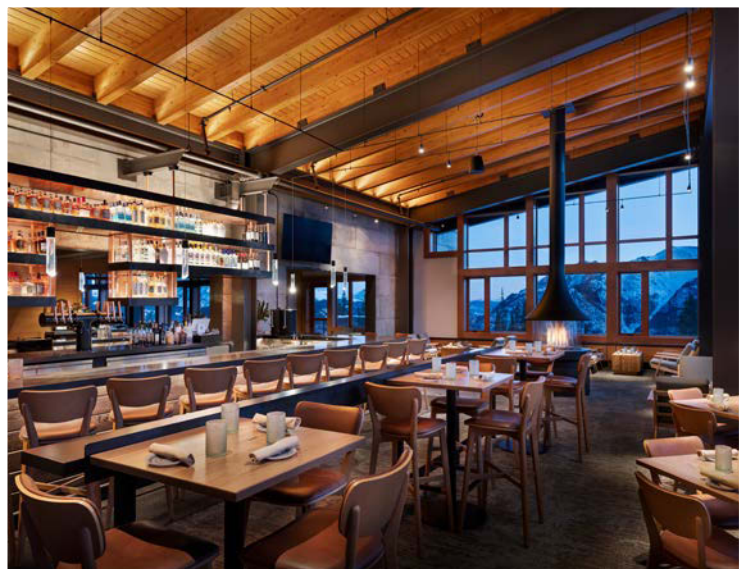
Cover Image: Restaurant | Inset Image: Bar

The project: This 23,000 sq ft lodge boasts a variety of dining options, including cafeteria-style dining, a formal restaurant, a cozy café, and two vibrant bars.