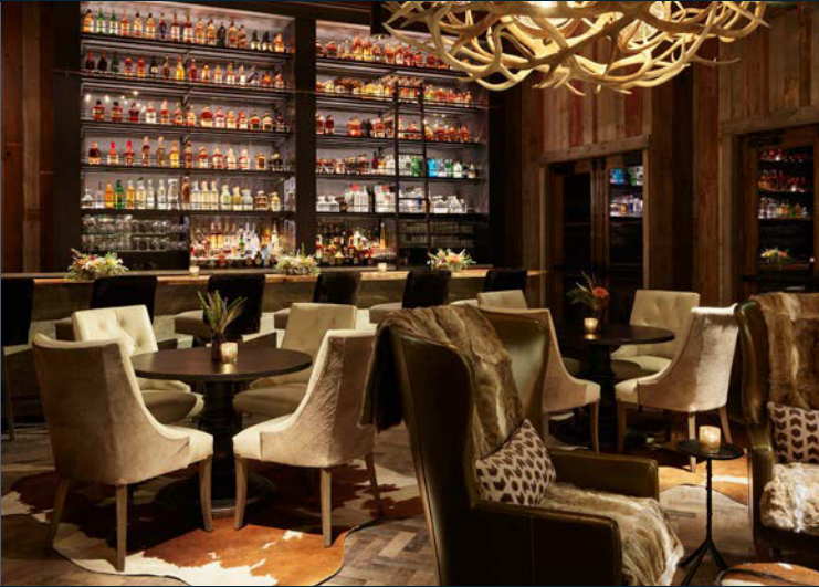
The Farm at Brush Creek