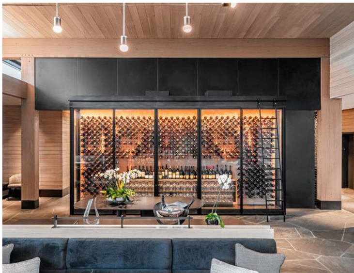
Cover Image: Dining | Inset Image: Wine Storage Display