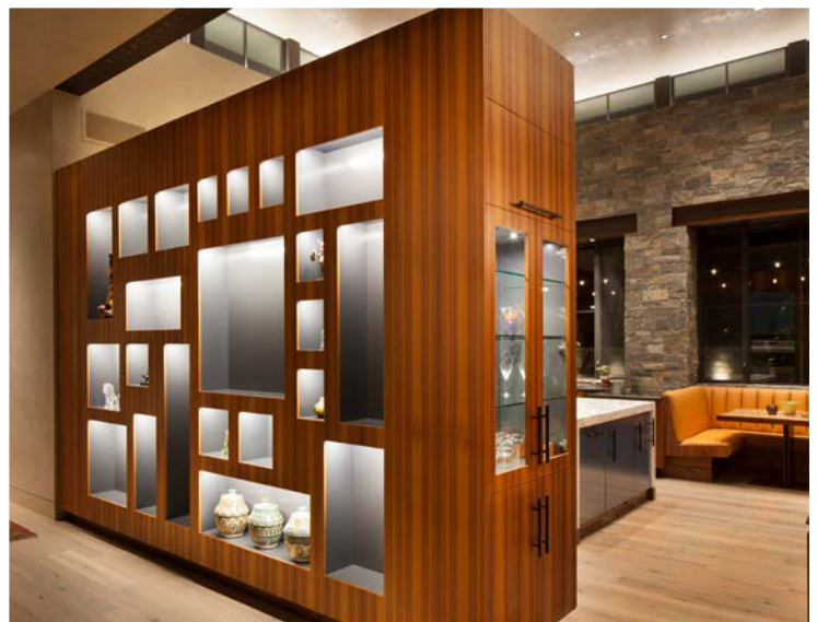
Cover Image: Exterior Courtyard | Inset Image: Kitchen Millwork

The project: Settled on a 128-acre site, this custom home harmoniously blends a modern design aesthetic with natural materials.