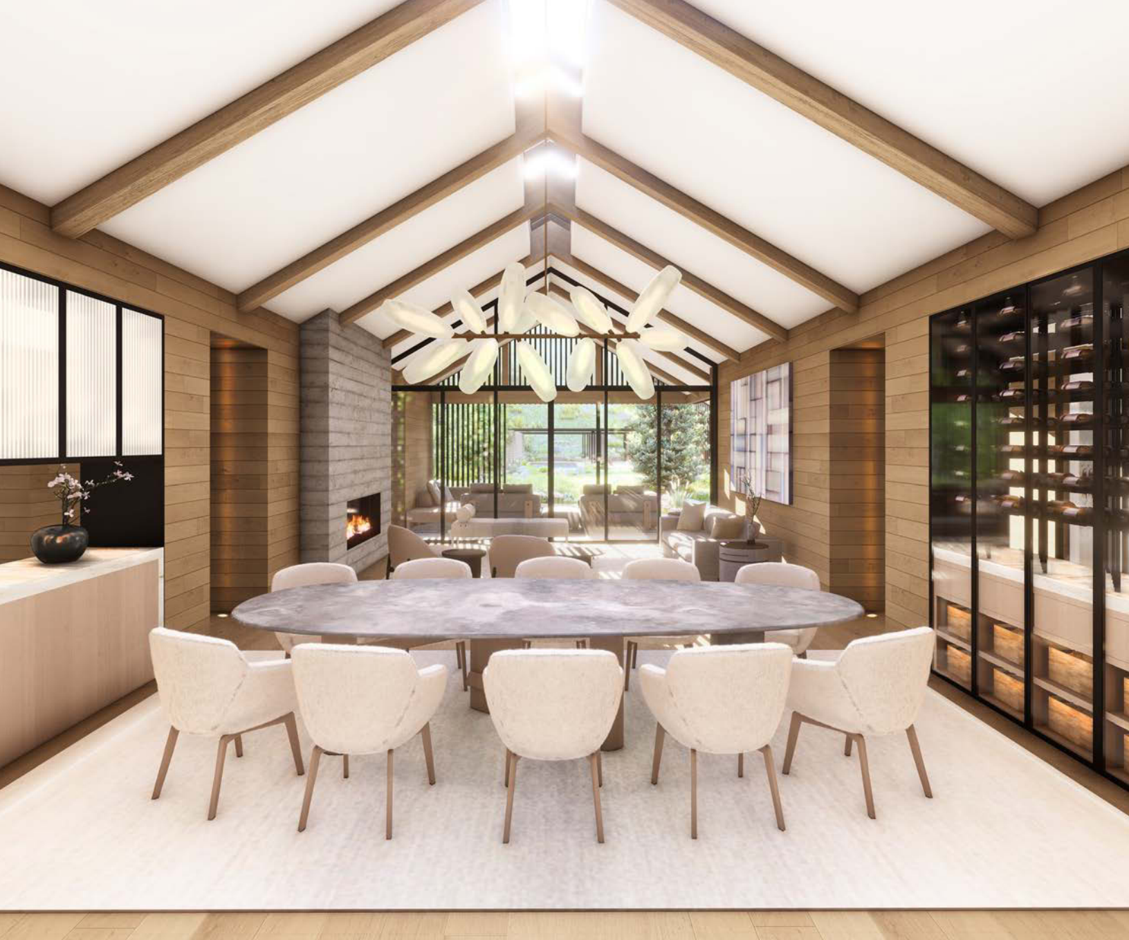
Cover Image: Dining and Living | Inset Image: Exterior Renderings courtesy of Forum Phi, lighting additions by Enlighten