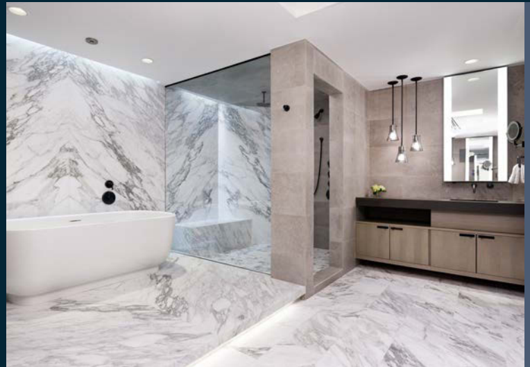
Four Seasons Vail Cloud 9 Residence

Downriver Residence Remodel , Aspen, CO | Custom Homes