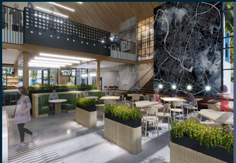
LC Pflugerville Amenities Building

Treehouse Kids' Adventure Center Remodel , Snowmass Village, CO | Recreation Facilities