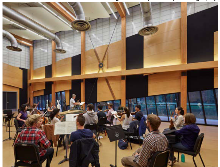
Cover Image: Exterior | Inset Image: Music Room

The project: This campus is cultural and educational center that hosts a diverse range of artistic programs, including visual arts, music, and performing arts.