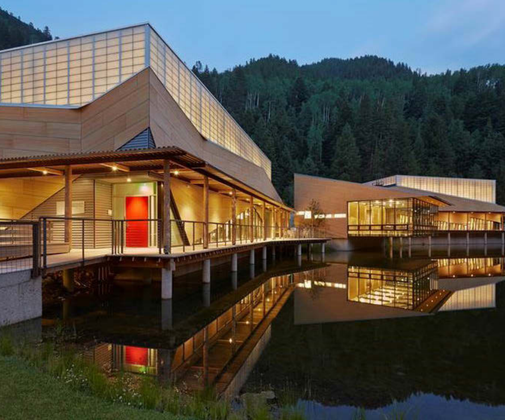
Harry Teague Architects