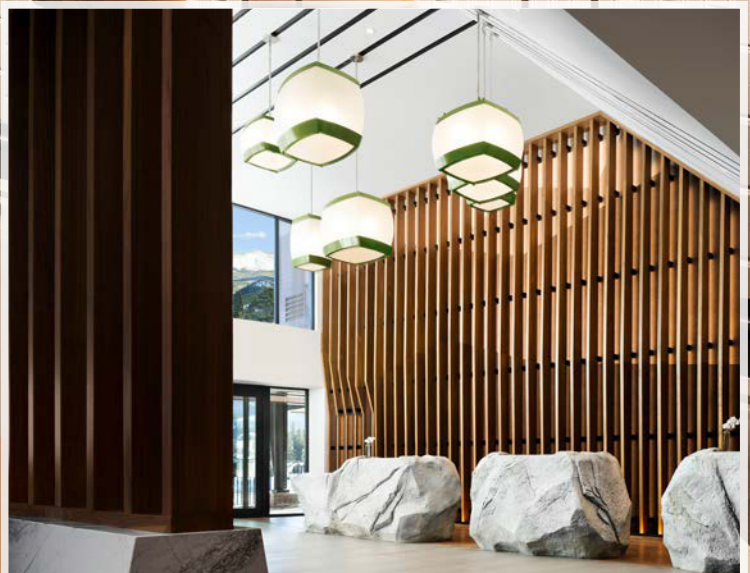
Cover Image: Lobby Bar | Inset Image: Entry Lobby

The project: 208 guest rooms and a suite of amenities spaces, including ballrooms, meeting rooms, restaurant, bar, and fitness room, were updated and upbranded to become a Curio.