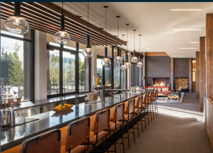
Ulery's Lake Lodge

Hotel Alpenrock Curio by Hilton , Breckenridge, CO | Full Service Hotel