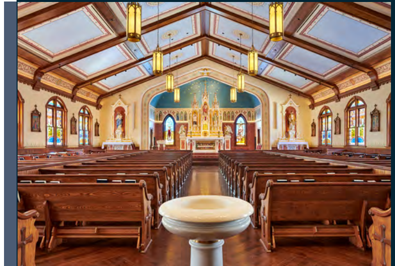
St. Mary's Catholic Church