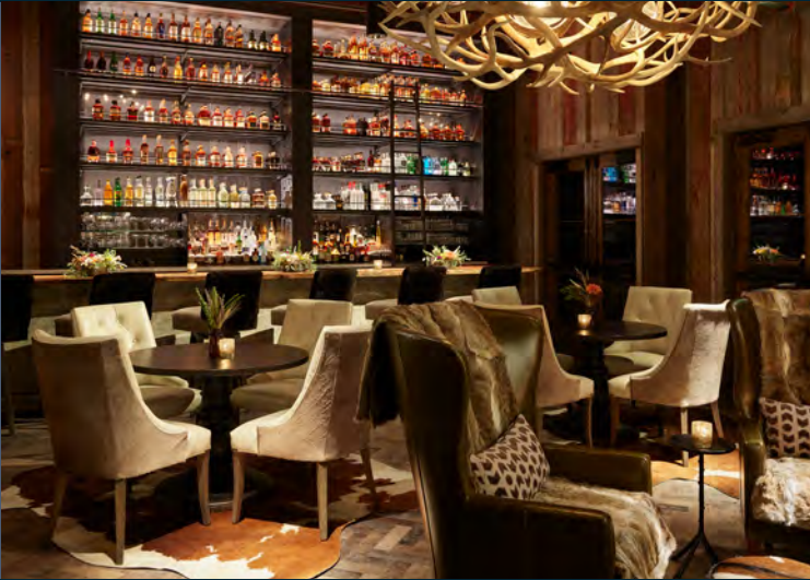
The Farm at Brush Creek