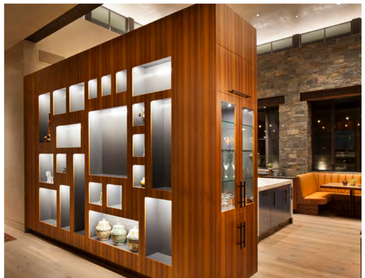
Cover Image: Exterior Courtyard | Inset Image: Kitchen Millwork

The project: Settled on a 128-acre site, this custom home harmoniously blends a modern design aesthetic with natural materials.