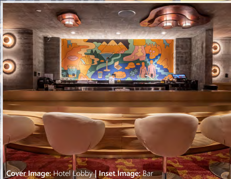
Cover Image: Hotel Lobby | Inset Image: Bar

Careful consideration was given to seamlessly integrating lighting with every architectural detail throughout the hotel. Sources were located to bring sparkle to mirrored metallics or provide depth to sculptural geometric forms.