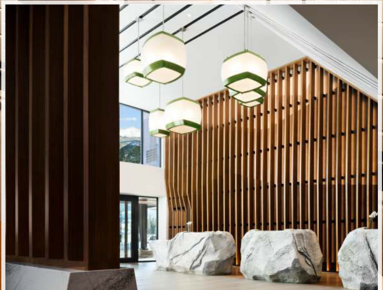
Cover Image: Lobby Bar | Inset Image: Entry Lobby

The project: 208 guest rooms and a suite of amenities spaces, including ballrooms, meeting rooms, restaurant, bar, and fitness room, were updated and upbranded to become a Curio.