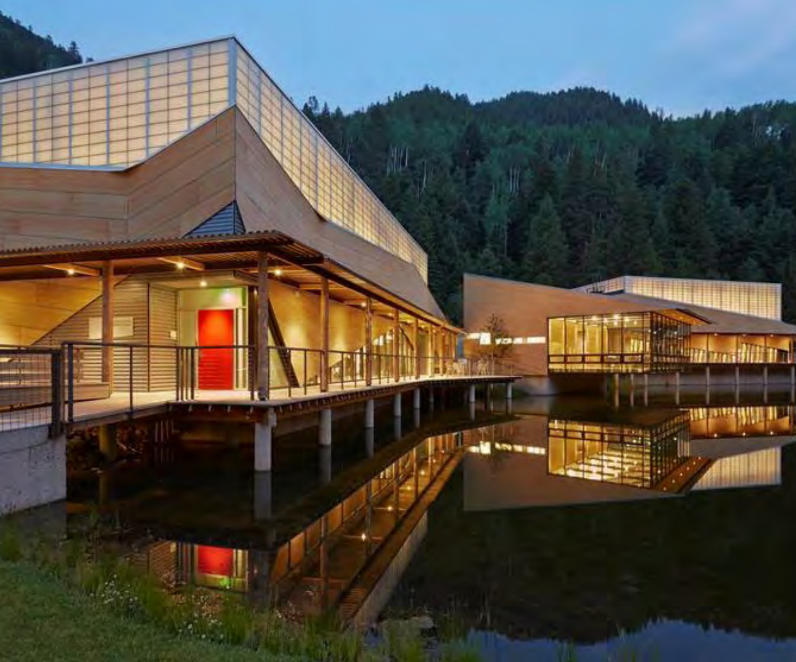
Harry Teague Architects