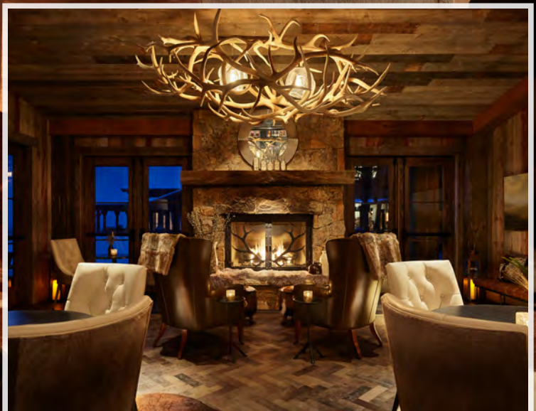
Cover Image: Spirit Bar | Inset Image: Lounge

The project: A 30,000 acre ranch offering 5-star amenities including dining, retail, brewery, distillery, wine tasting, meeting spaces, and an event pavilion.