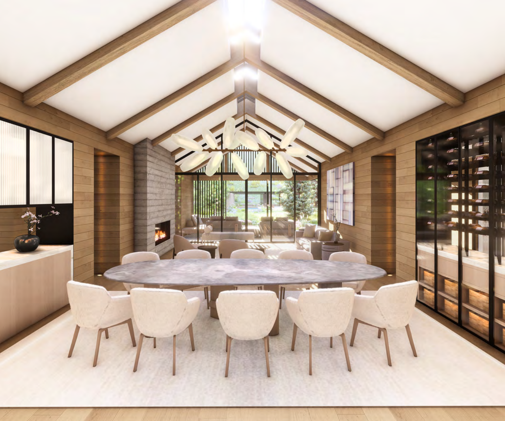
Cover Image: Dining and Living | Inset Image: Exterior Renderings courtesy of Forum Phi, lighting additions by Enlighten