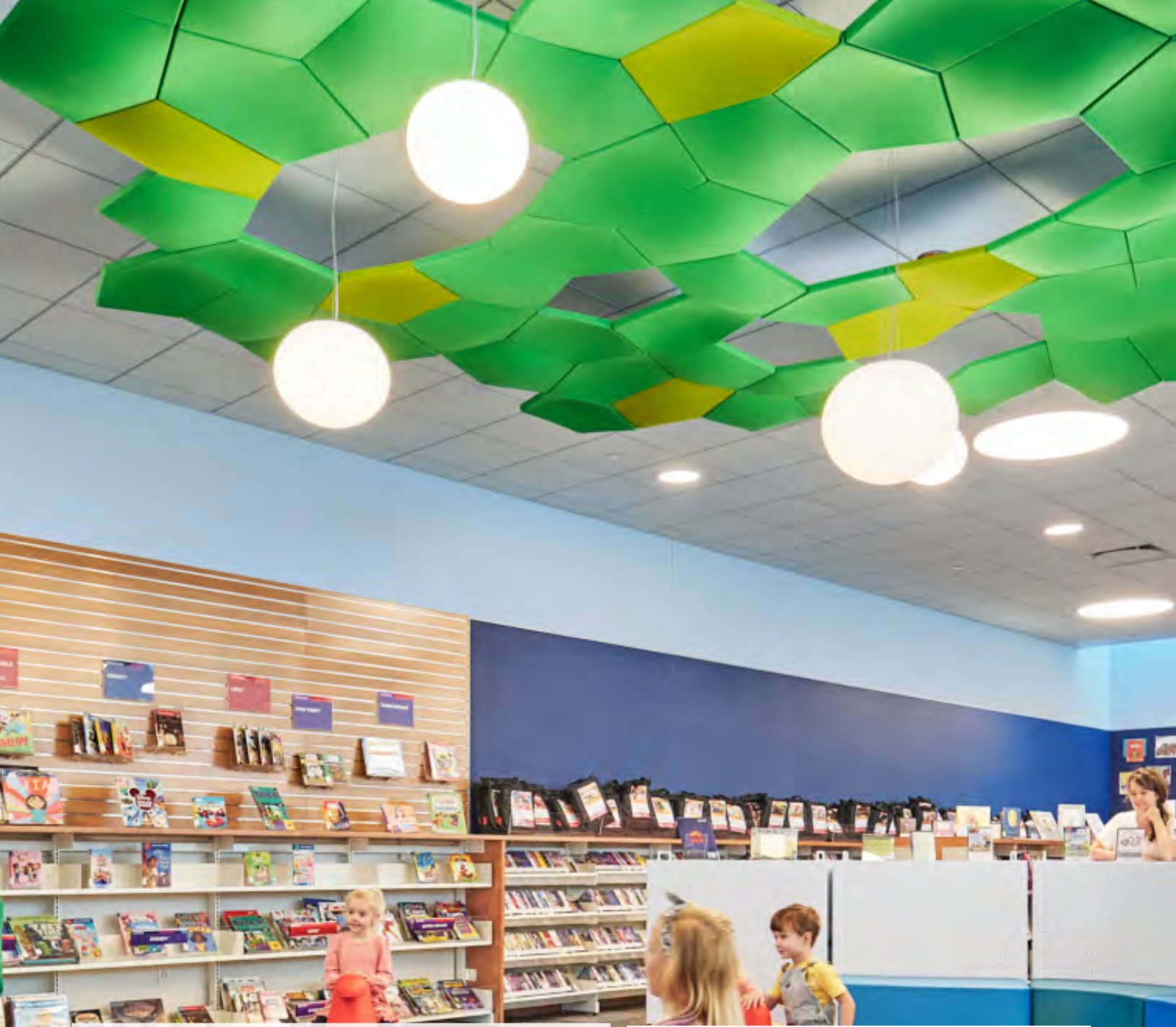
Cover Image: Childrens' Reading Area | Inset Image: Entry Lobby