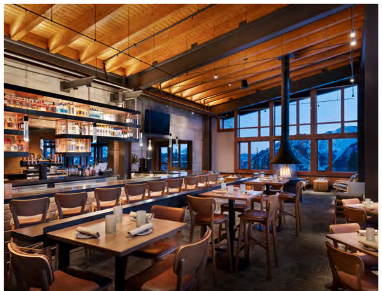
Cover Image: Restaurant | Inset Image: Bar

The project: This 23,000 sq ft lodge boasts a variety of dining options, including cafeteria-style dining, a formal restaurant, a cozy café, and two vibrant bars.