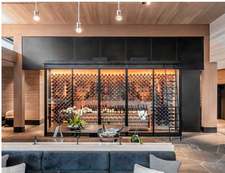
Cover Image: Dining | Inset Image: Wine Storage Display