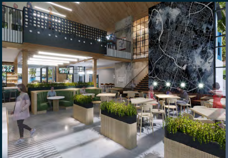
LC Pflugerville Amenities Building

Treehouse Kids' Adventure Center Remodel , Snowmass Village, CO | Recreation Facilities