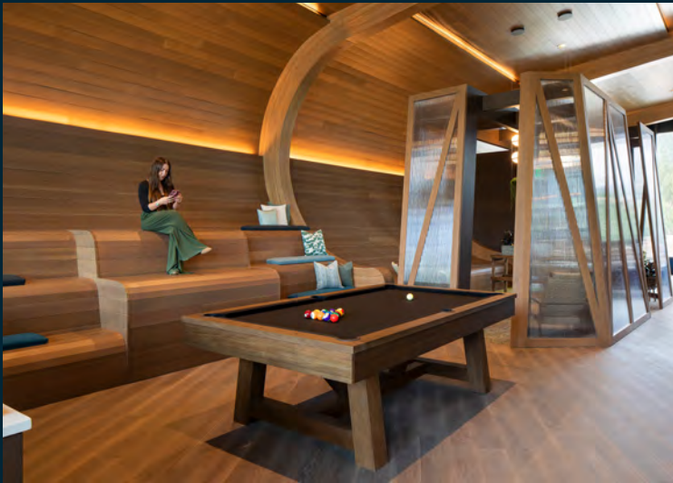
Lone Rock Retreat