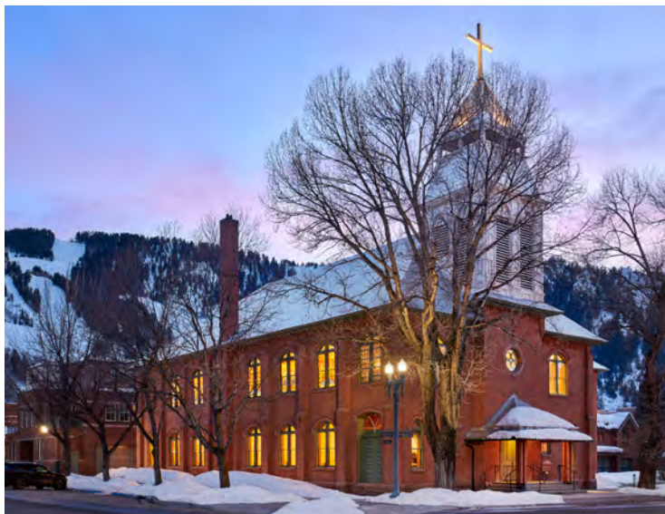
Cover Image: Sanctuary | Inset Image: Church Exterior