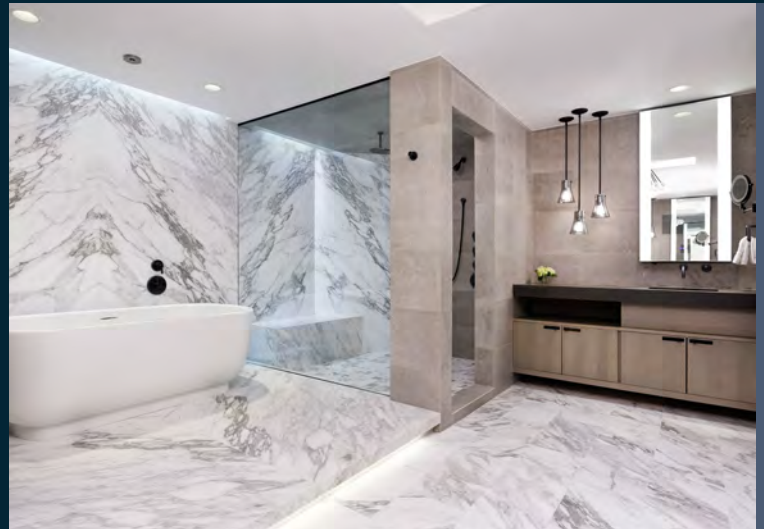
Four Seasons Vail Cloud 9 Residence

Downriver Residence Remodel , Aspen, CO | Custom Homes