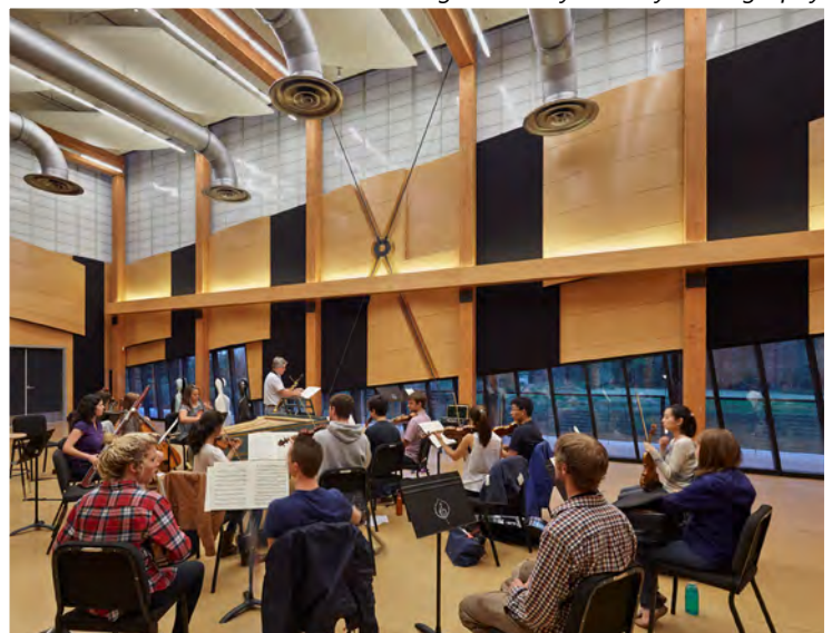
Cover Image: Exterior | Inset Image: Music Room

The project: This campus is cultural and educational center that hosts a diverse range of artistic programs, including visual arts, music, and performing arts.